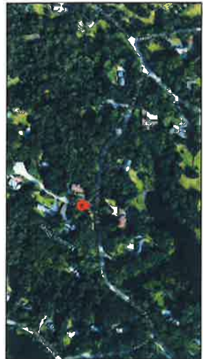
AERIAL IMAGE SCALE: 1" = 200'