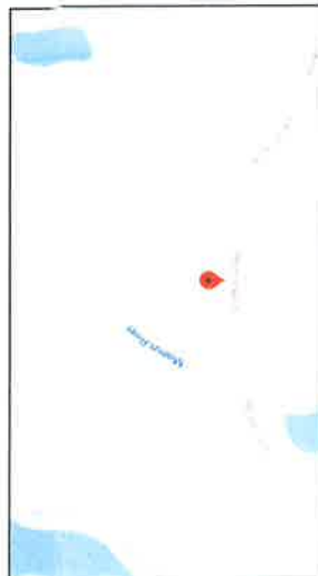
PLAN - LOCATION MAP SCALE: 1" = 200'