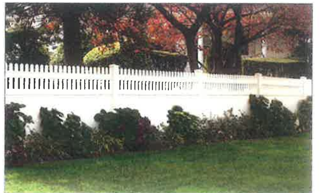
| OKLAHOMA with OPEN SPINDLE |