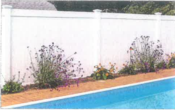
| OKLAHOMA |

The Oklahoma Privacy styles are available in heights ranging from 3 to 8 feet.