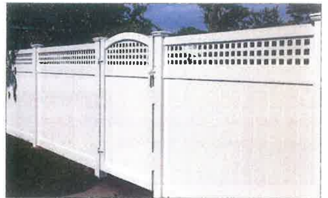
| OKLAHOMA with SQUARE MINI LATTICE TOPPER |