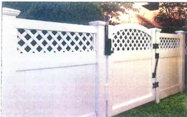
| OKLAHOMA DELUXE DIAGONAL LATTICE and a CROWNED WALK GATE |