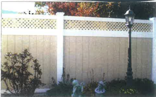
| OKLAHOMA with DIAGONAL MINI LATTICE TOPPER | 2 Tone