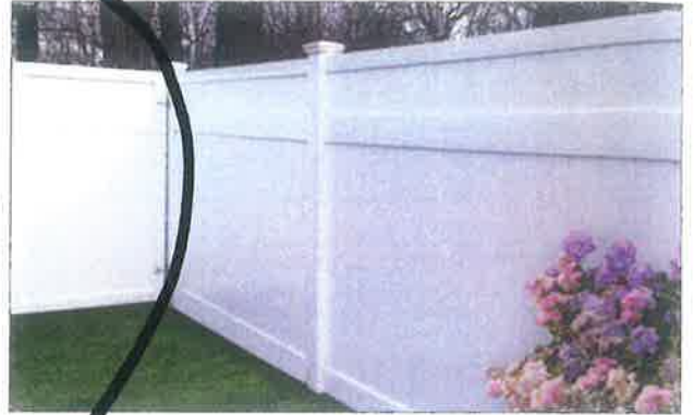
| OKLAHOMA with OKLAHOMA TOPPER |