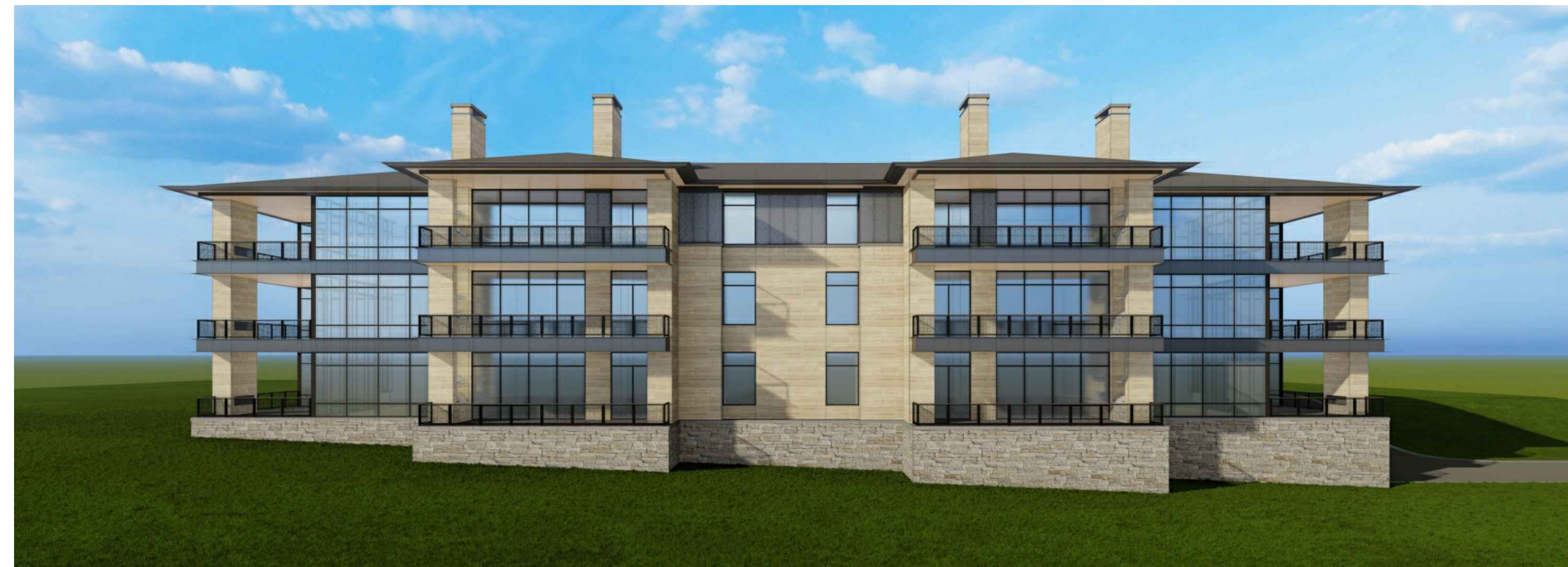
2 WEST ELEVATION - VIEW 12-UNIT N.T.S.