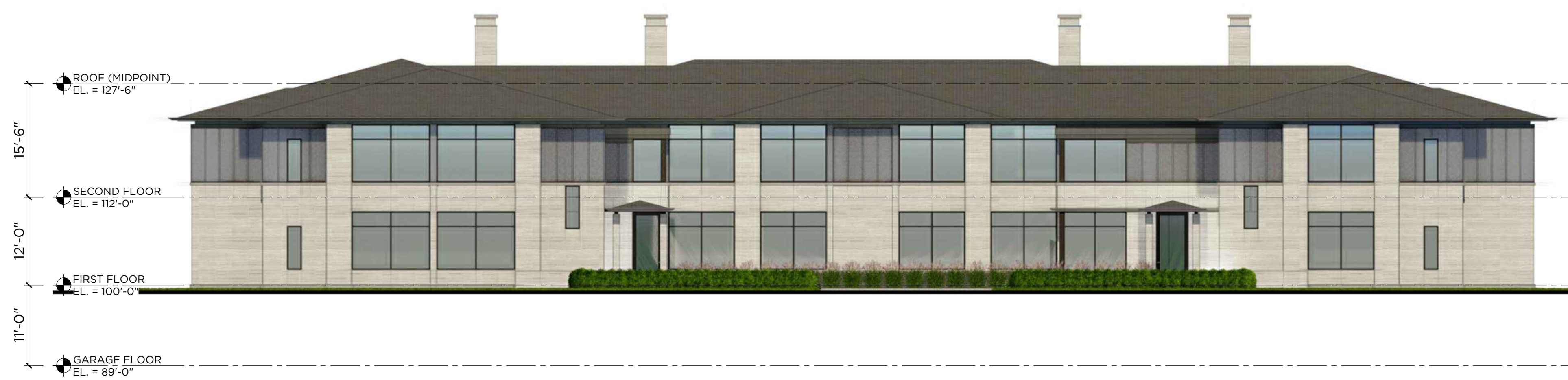
5 EAST ELEVATION 8-UNIT 3/32" = 1'-0"