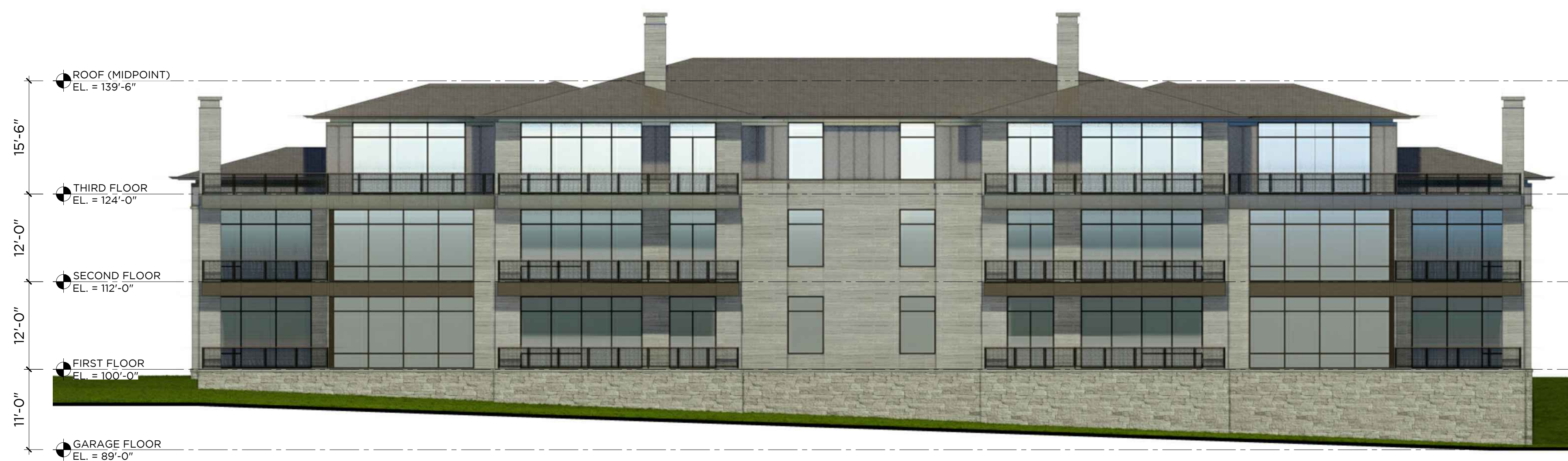
3 WEST ELEVATION 10-UNIT 3/32" = 1'-0"