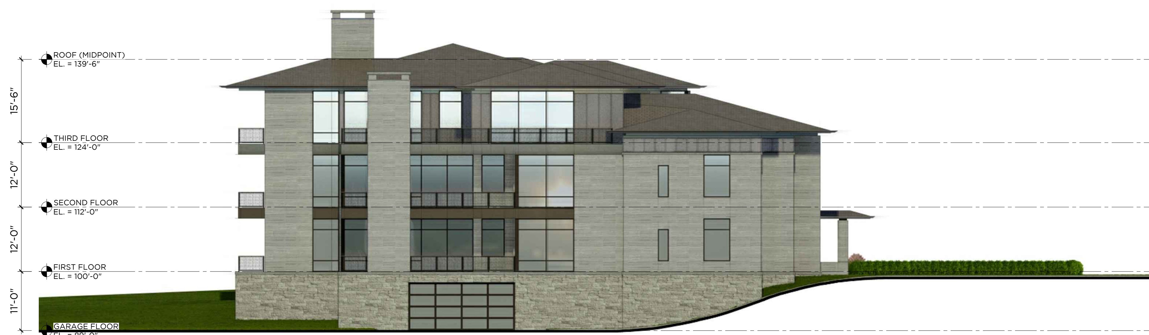
3 SOUTH ELEVATION 10-UNIT 3/32" = 1'-0"