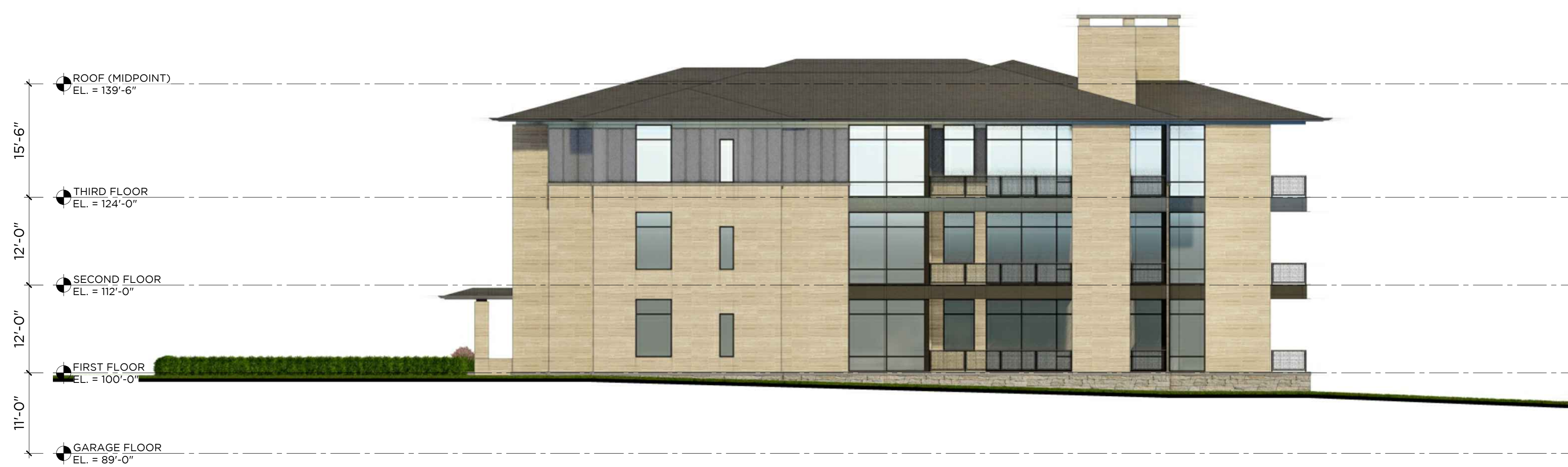
1 NORTH ELEVATION 12-UNIT 3/32" = 1'-0"

Electrical: Company Name Street Address City, State Phone Number