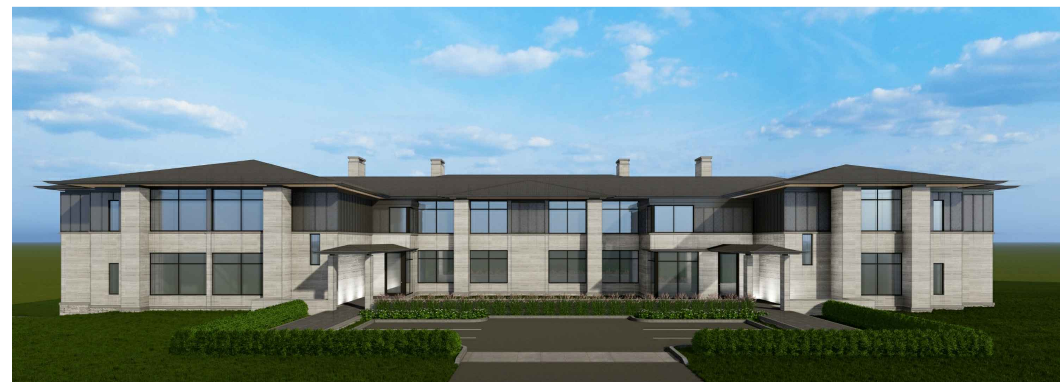
6 EAST ELEVATION - VIEW 8-UNIT N.T.S.