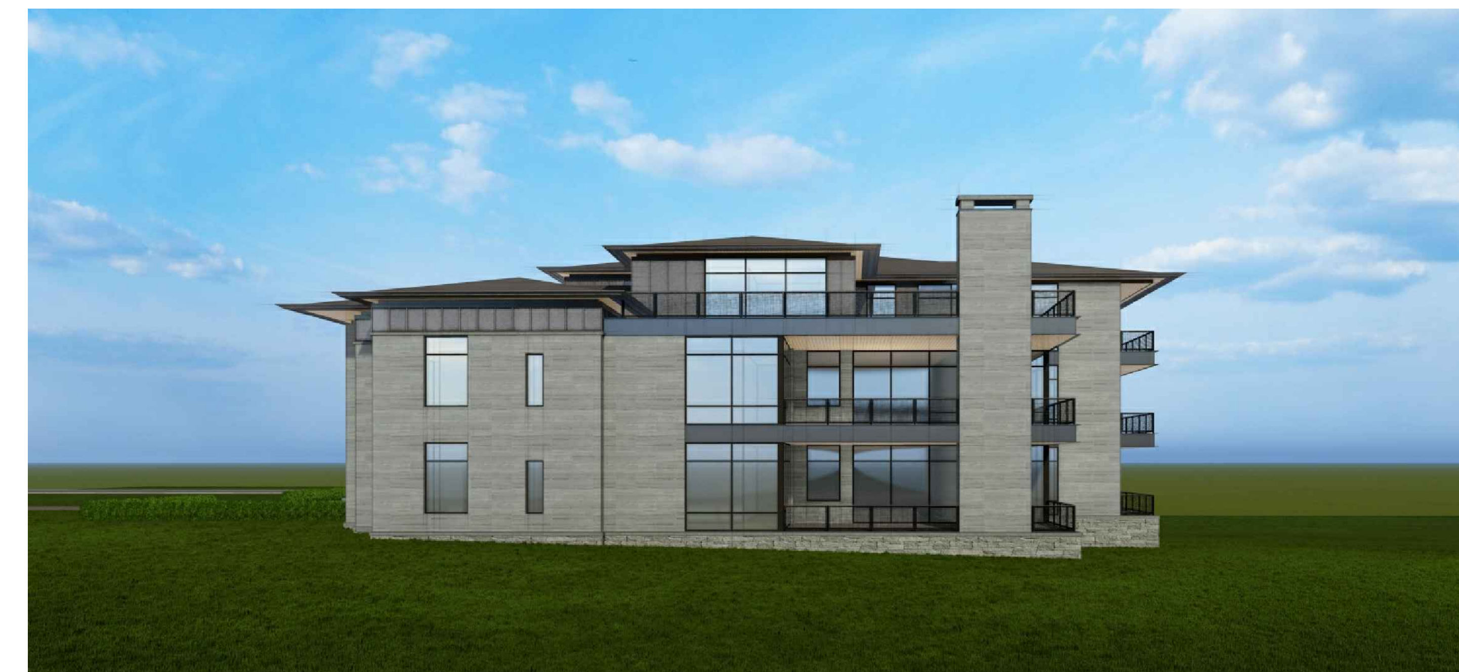
4 NORTH ELEVATION - VIEW 10-UNIT N.T.S.