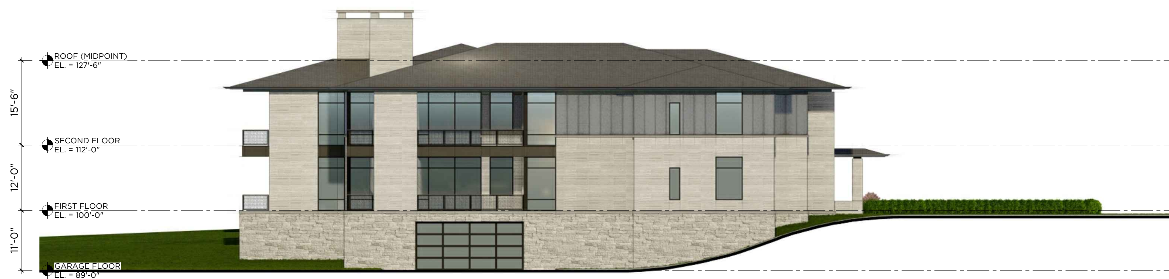
5 SOUTH ELEVATION 8-UNIT 3/32" = 1'-0"