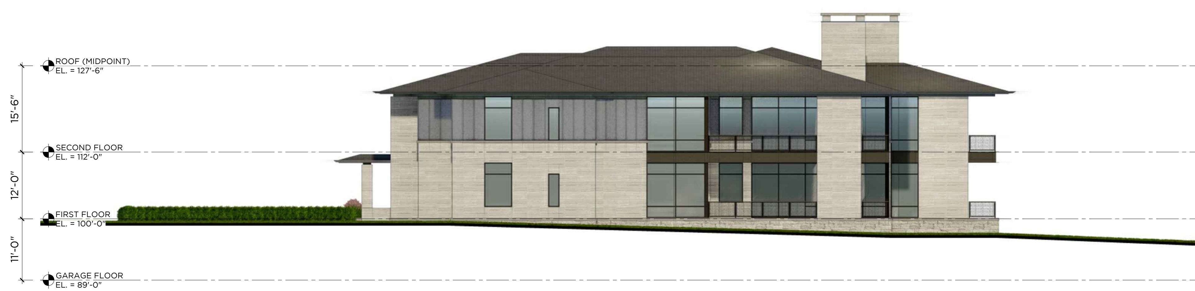
5 NORTH ELEVATION 8-UNIT 3/32" = 1'-0"