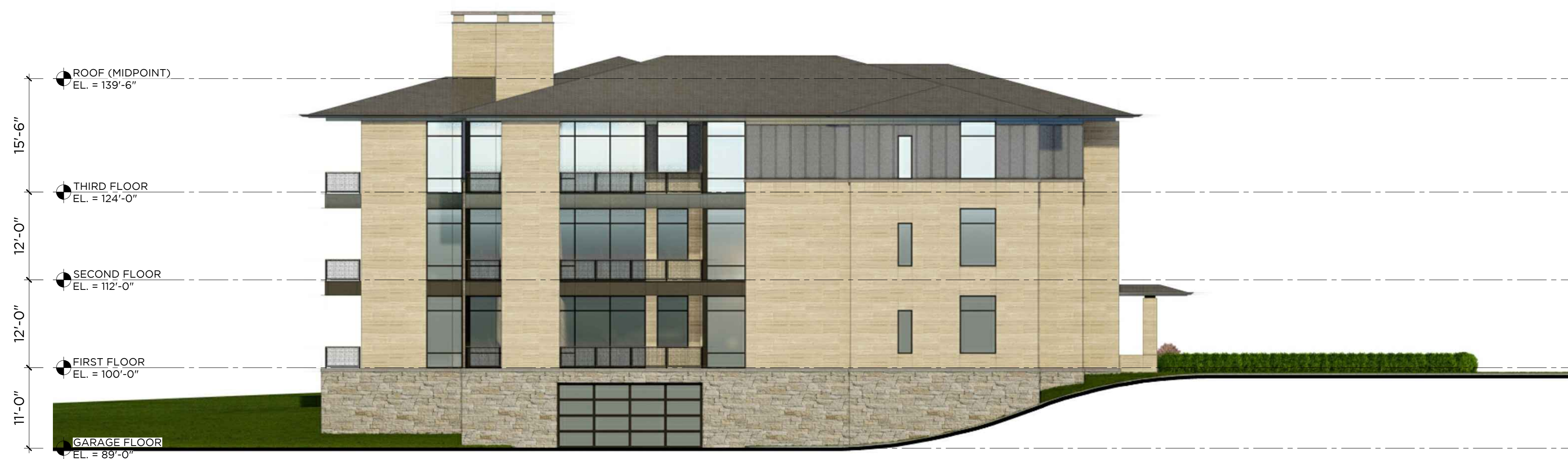
1 SOUTH ELEVATION 12-UNIT 3/32" = 1'-0"

Electrical: Company Name Street Address City, State Phone Number