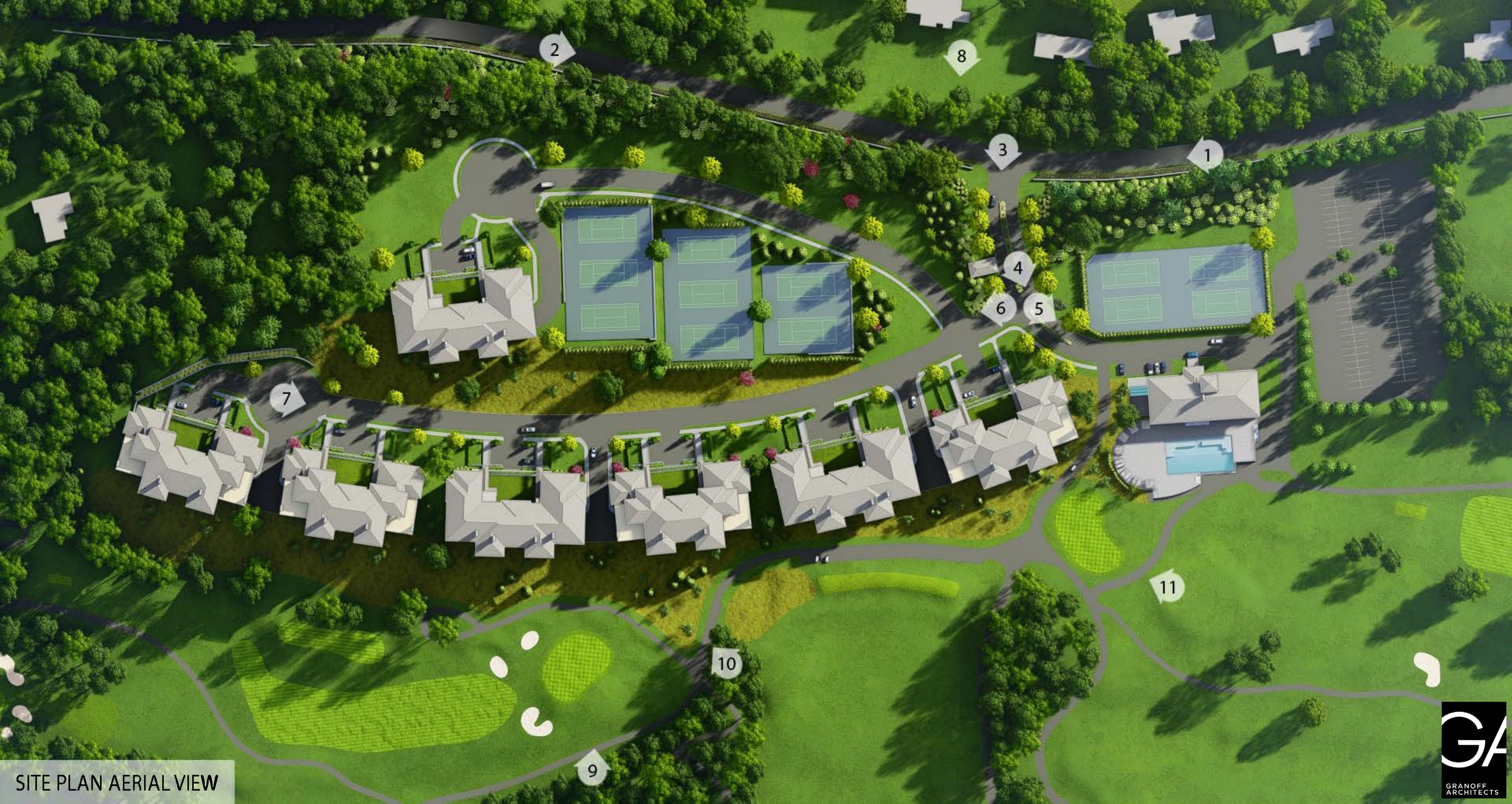
SITE PLAN AERIAL VIEW