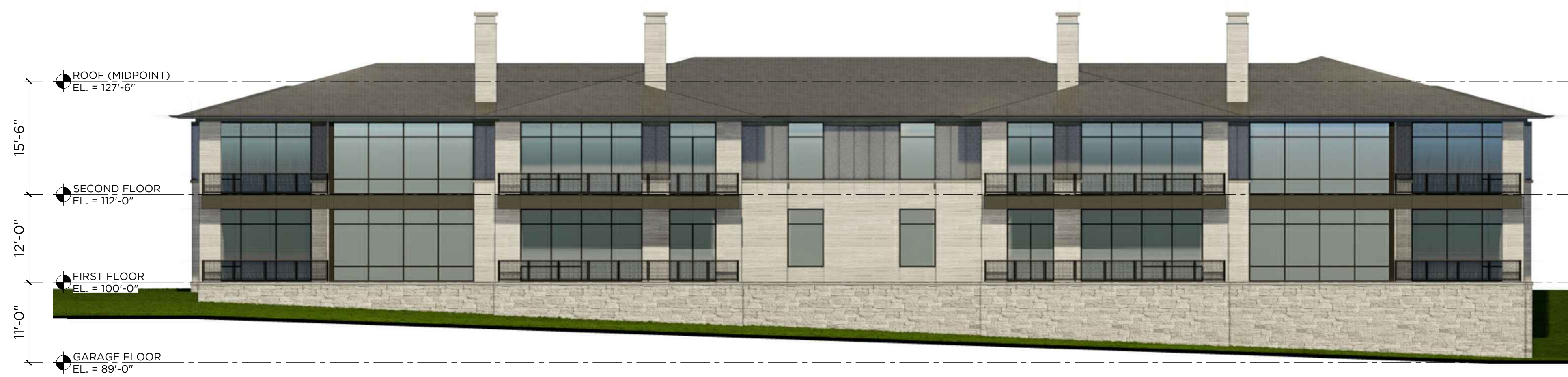
5 EAST ELEVATION 8-UNIT 3/32" = 1'-0"