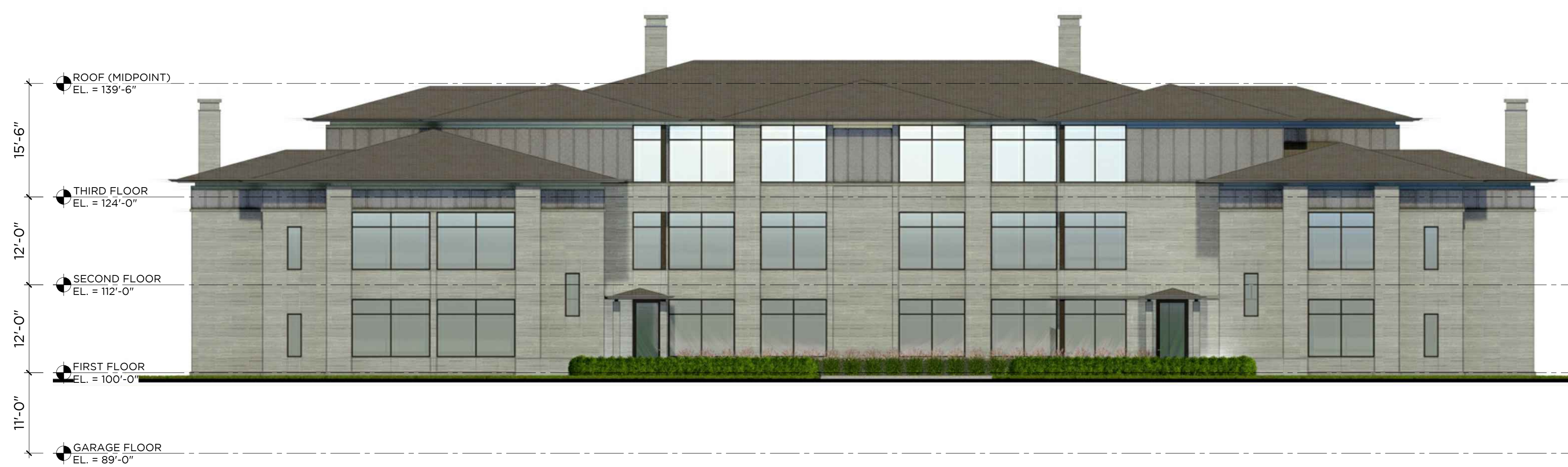
3 EAST ELEVATION 10-UNIT 3/32" = 1'-0"