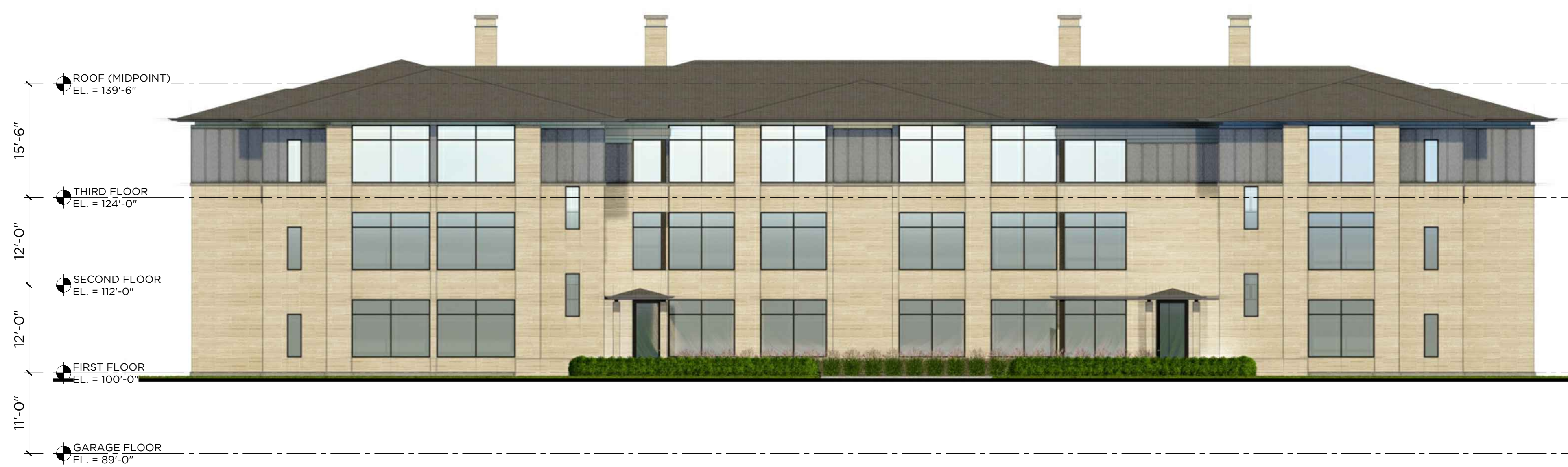
1 EAST ELEVATION 12-UNIT 3/32" = 1'-0"

Electrical: Company Name Street Address City, State Phone Number