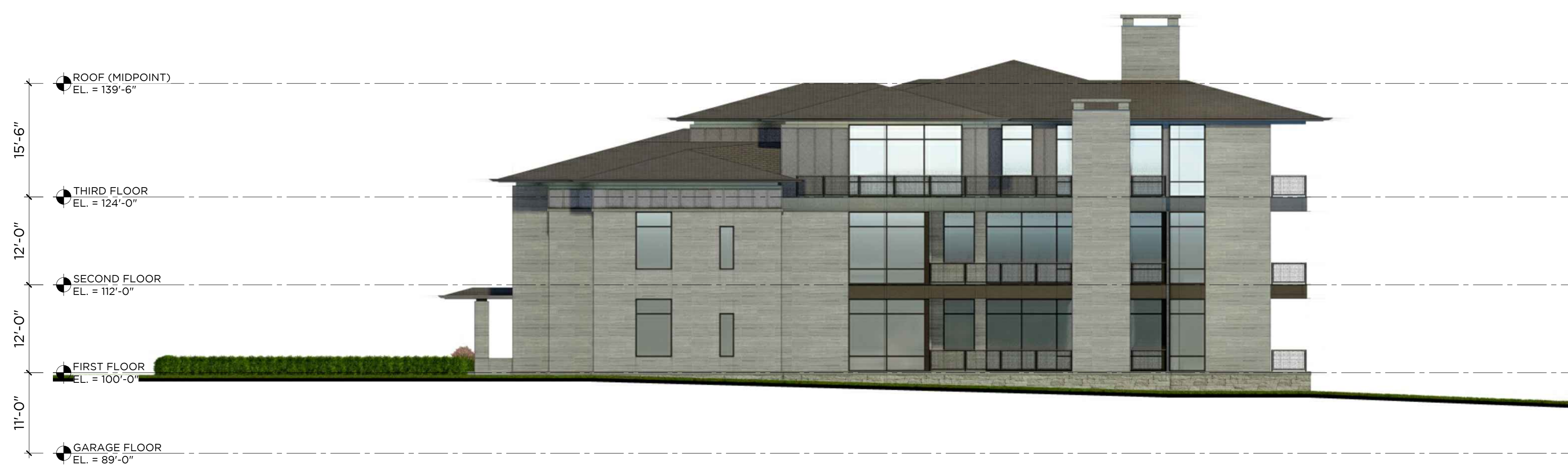
3 NORTH ELEVATION 10-UNIT 3/32" = 1'-0"