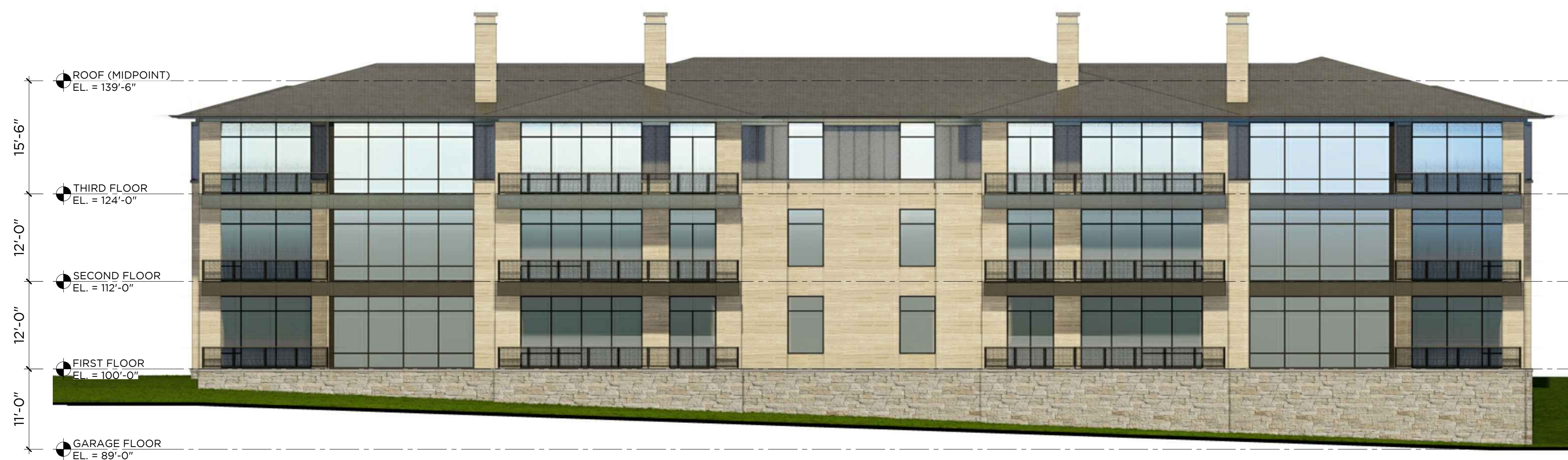
1 WEST ELEVATION 12-UNIT 3/32" = 1'-0"

Electrical: Company Name Street Address City, State Phone Number