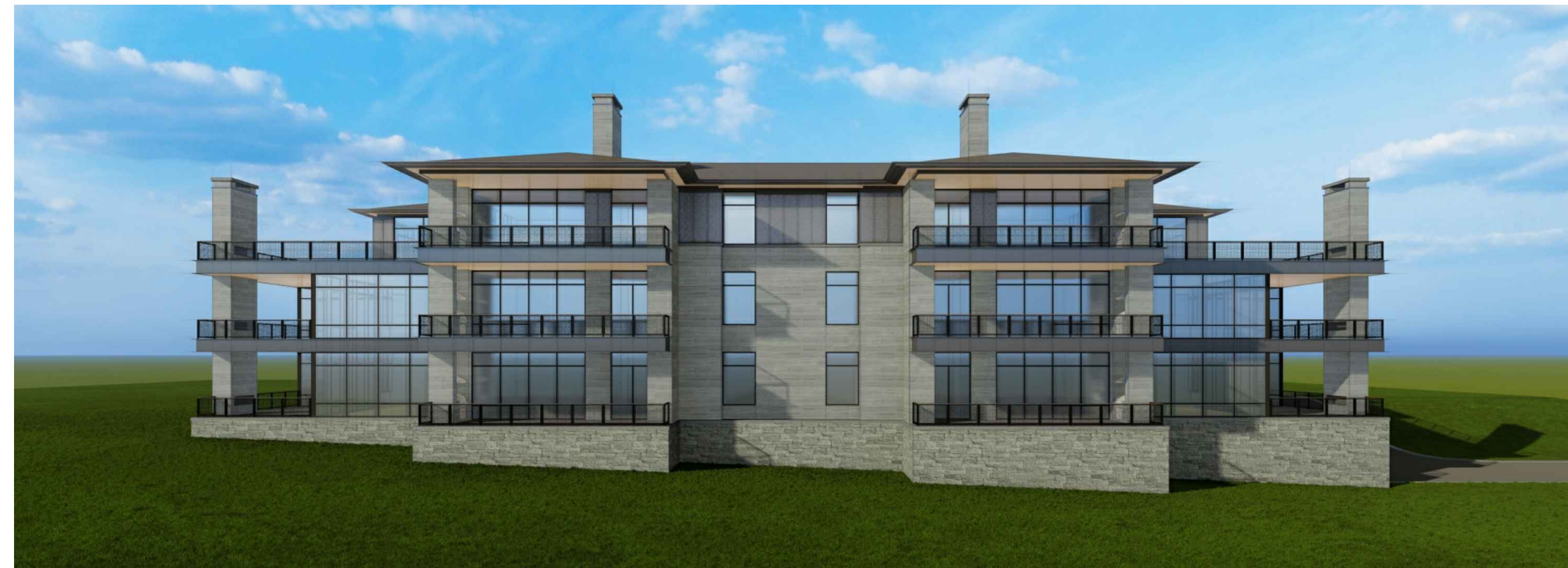
4 WEST ELEVATION - VIEW 10-UNIT N.T.S.