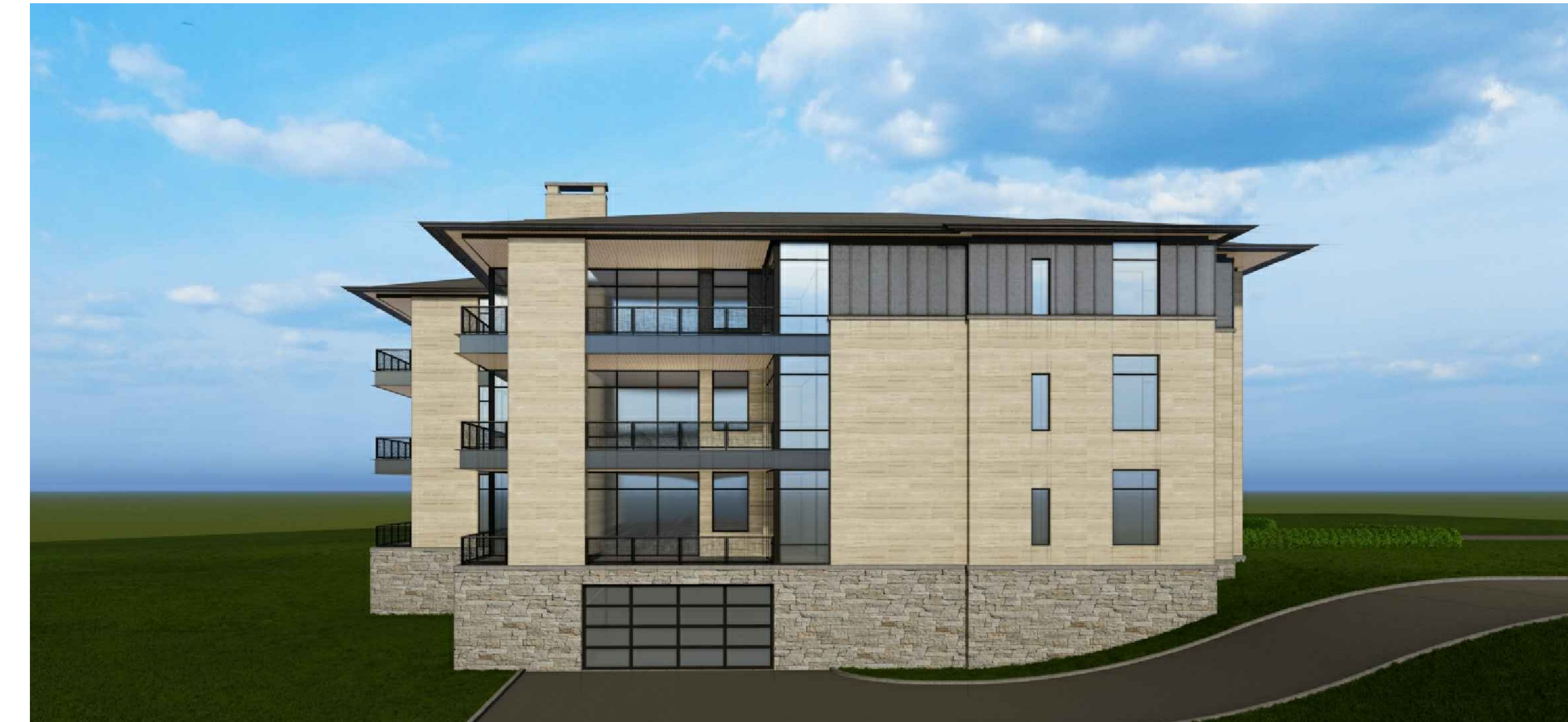
2 SOUTH ELEVATION - VIEW 12-UNIT N.T.S.