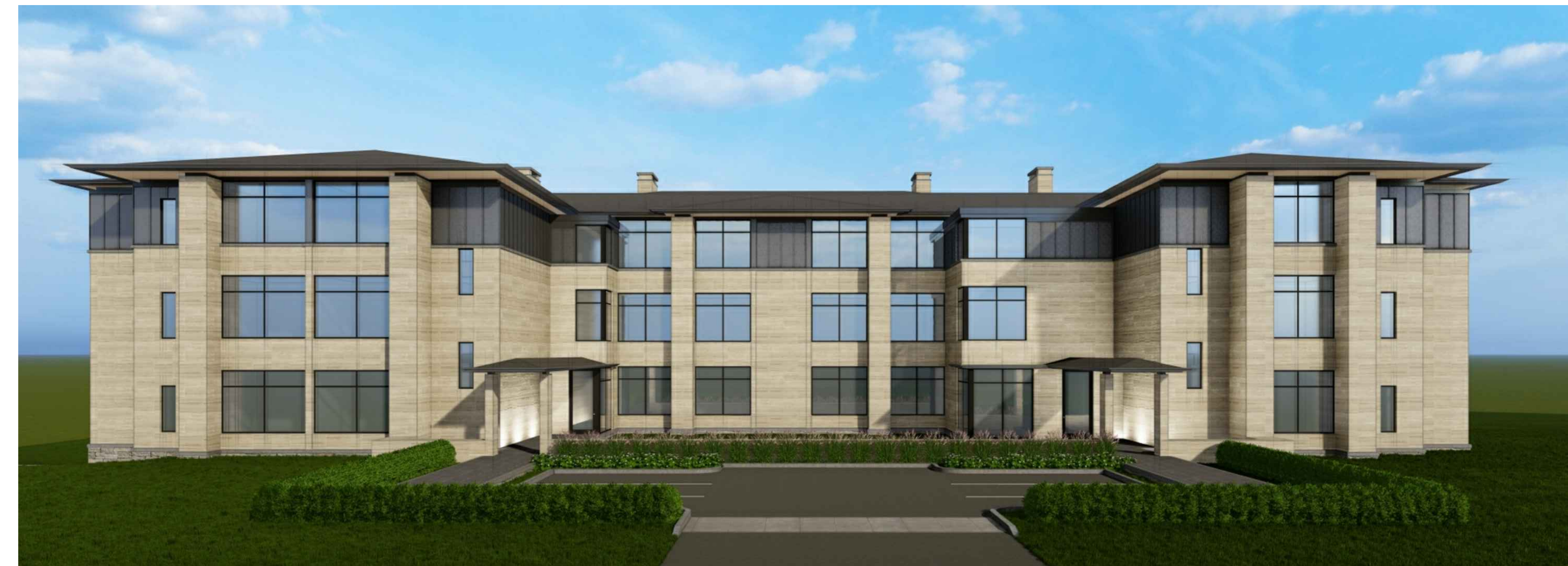
2 EAST ELEVATION - VIEW 12-UNIT N.T.S.