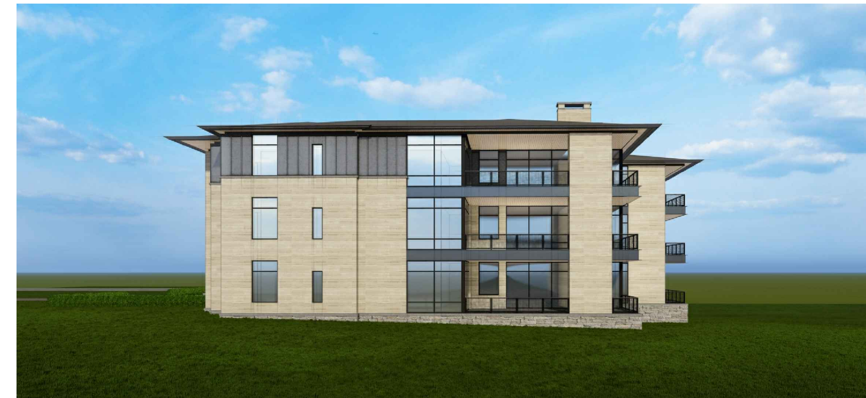
2 NORTH ELEVATION - VIEW 12-UNIT N.T.S.