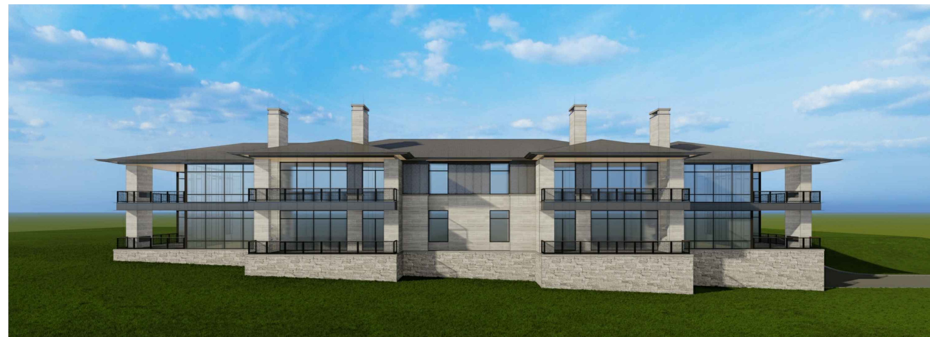
6 EAST ELEVATION - VIEW 8-UNIT N.T.S.