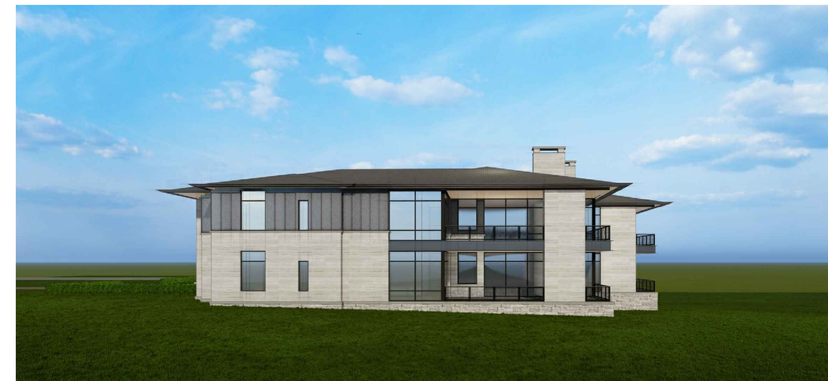
6 NORTH ELEVATION - VIEW 8-UNIT N.T.S.