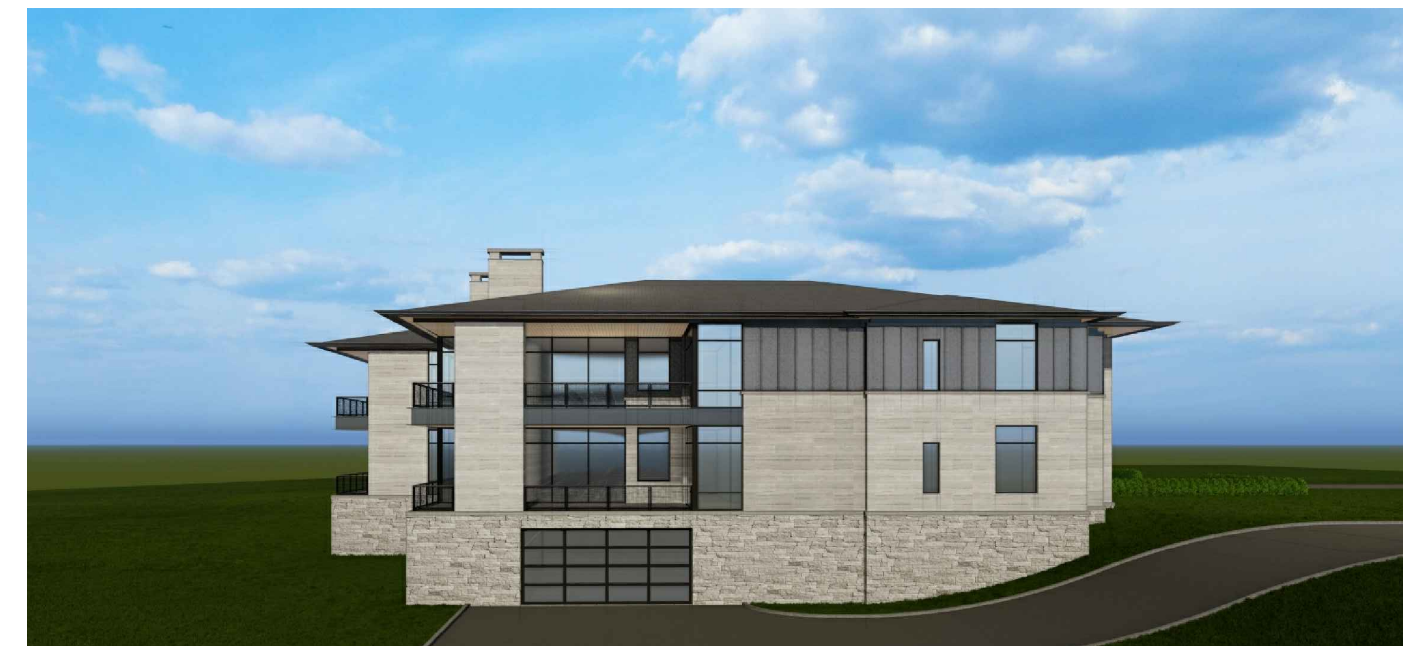
6 SOUTH ELEVATION - VIEW 8-UNIT N.T.S.