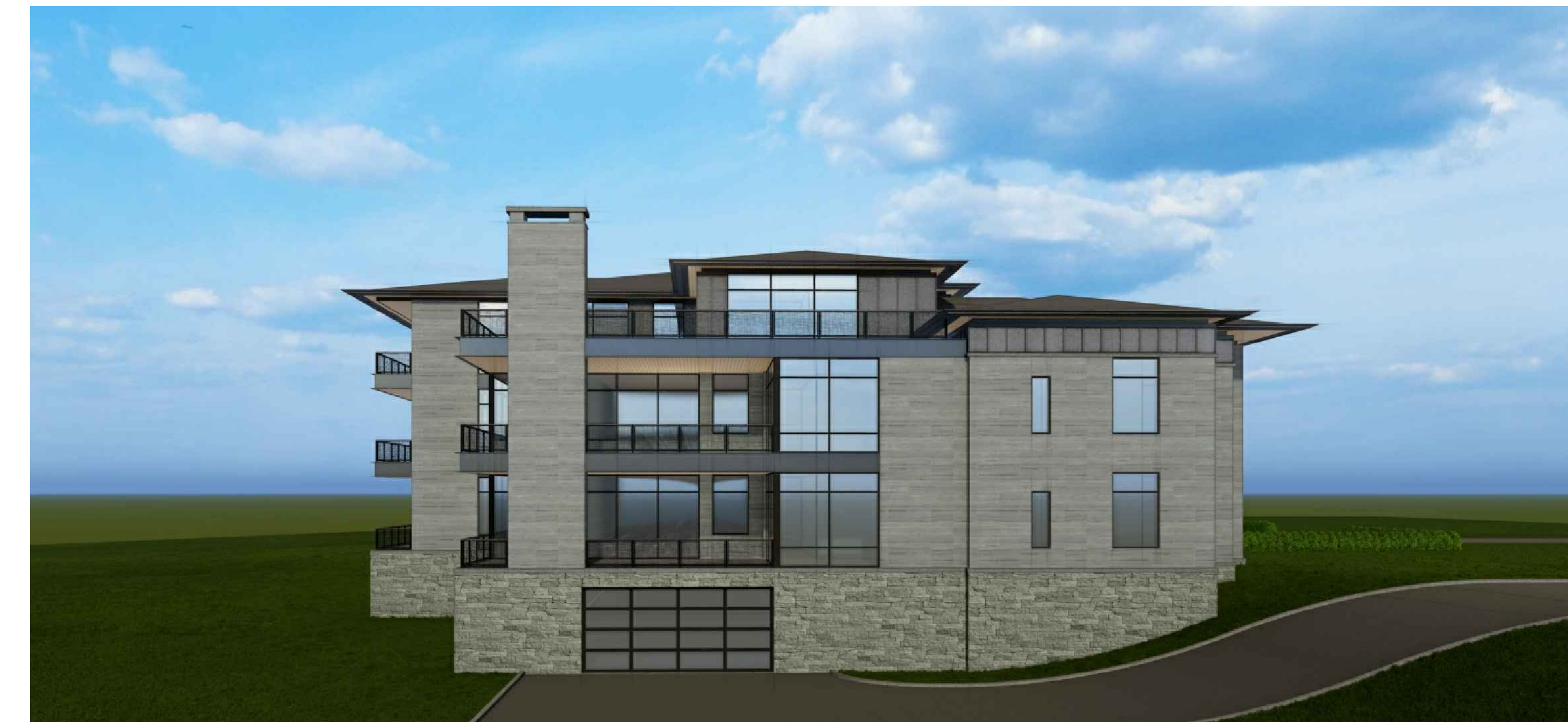
4 SOUTH ELEVATION - VIEW 10-UNIT N.T.S.