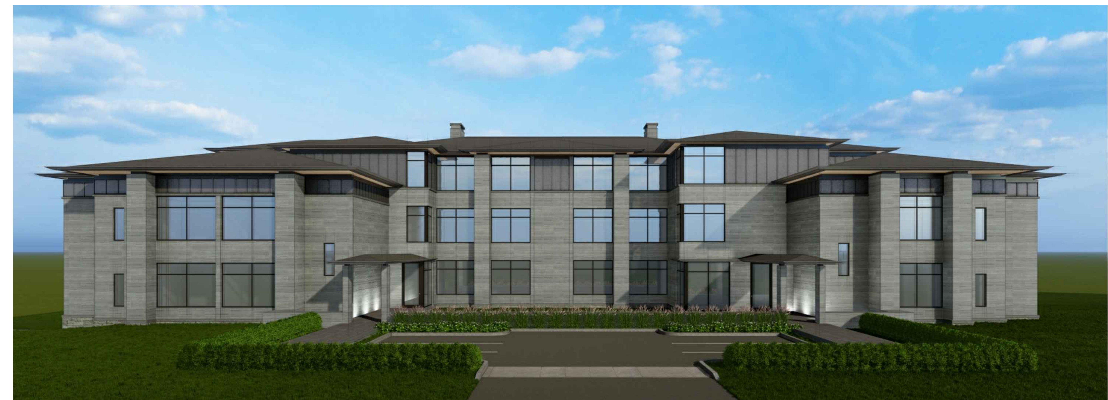
4 EAST ELEVATION - VIEW 10-UNIT N.T.S.