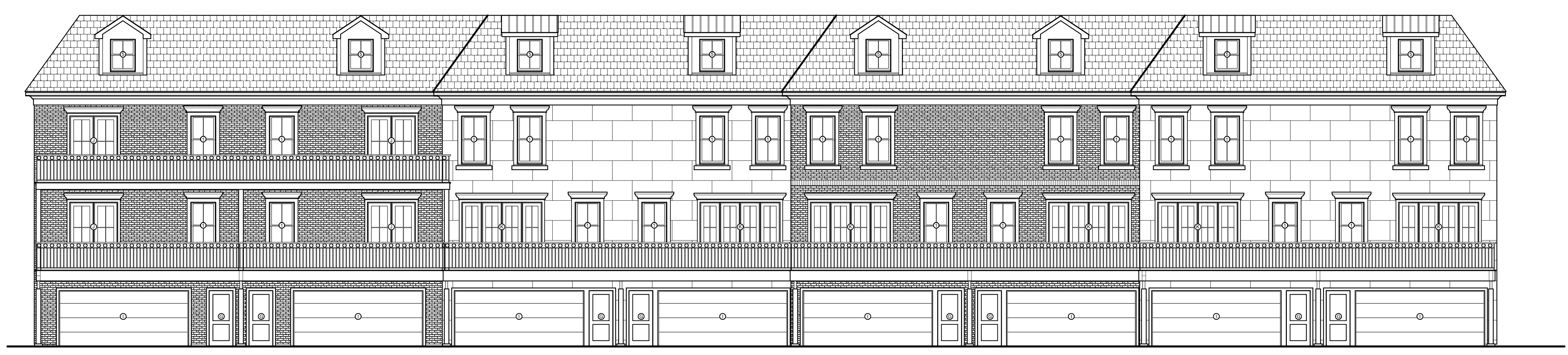
4 WEST ELEVATION SCALE: 1/8" = 1'-0"

TOP OF ROOF ELEV. 485 MID POINT OF ROOF ELEV. 486 FIN. THIRD FLOOR ELEV. 460 FIN. SECOND FLOOR ELEV. 384 FIN. FIRST FLOOR ELEV. 360 FIN. ENTRANCE LEVEL ELEV. 365 FIN. GARAGE FLOOR ELEV. 310