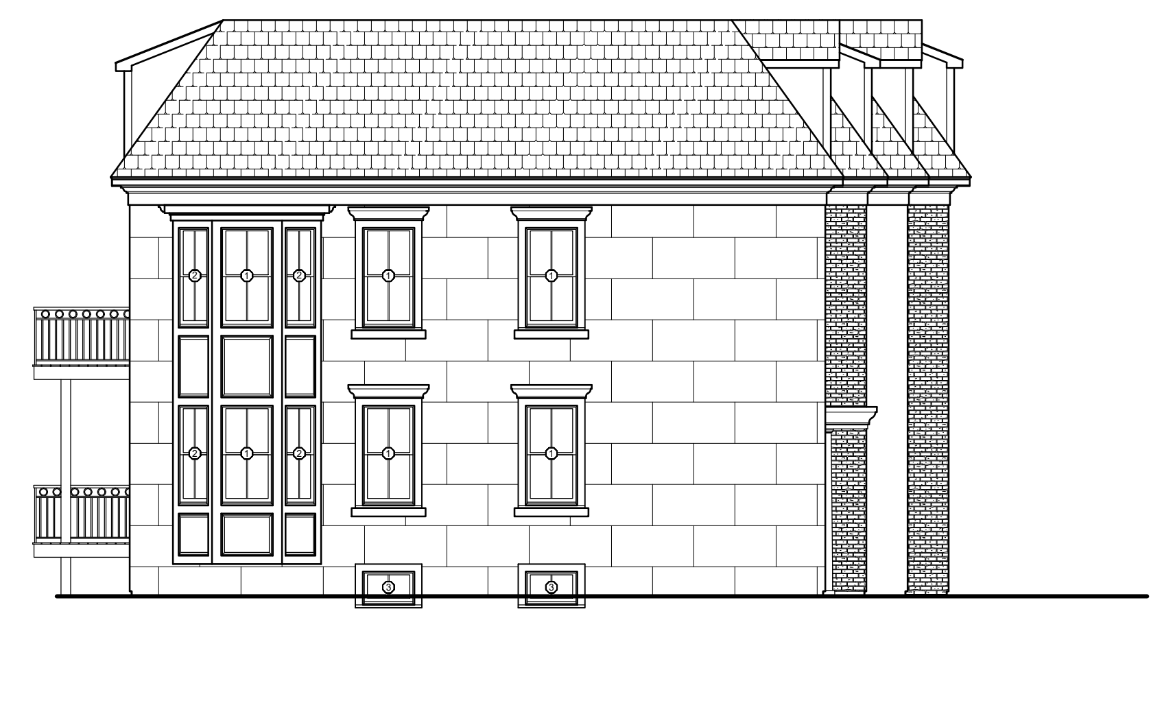
3 NORTH ELEVATION SCALE: 1/8" = 1'-0"

TOP OF ROOF ELEV. 485 MID POINT OF ROOF ELEV. 486 FIN. THIRD FLOOR ELEV. 460 FIN. SECOND FLOOR ELEV. 384 FIN. FIRST FLOOR ELEV. 360 FIN. ENTRANCE LEVEL ELEV. 365 FIN. GARAGE FLOOR ELEV. 310