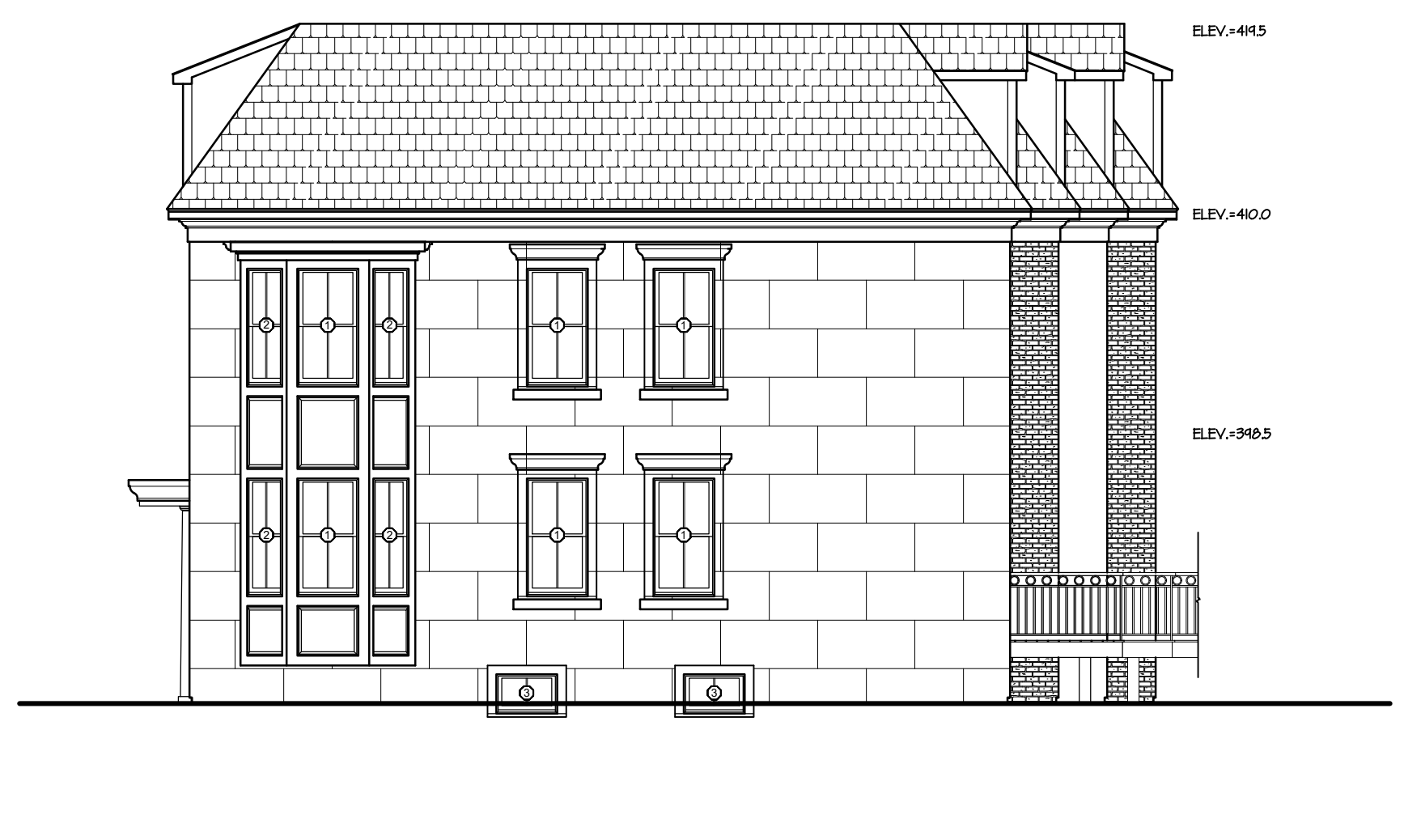
3 NORTH ELEVATION SCALE: 1/8" = 1'-0"

TOP OF ROOF ELEV. 485 MID POINT OF ROOF ELEV. 456 FIN. THIRD FLOOR ELEV. 402 FIN. SECOND FLOOR ELEV. 364 FIN. FIRST FLOOR ELEV. 360 FIN. ENTRANCE LEVEL ELEV. 363 FIN. GARAGE FLOOR ELEV. 312