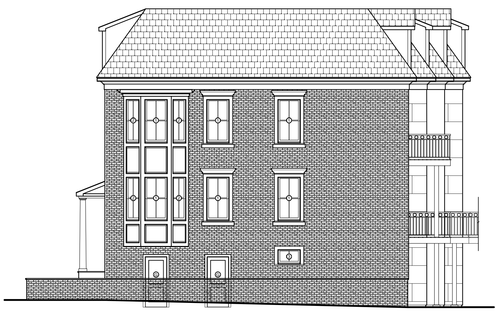
2 SOUTH ELEVATION SCALE: 1/8" = 1'-0"

TOP OF ROOF ELEV. 485 MID POINT OF ROOF ELEV. 486 FIN. THIRD FLOOR ELEV. 460 FIN. SECOND FLOOR ELEV. 384 FIN. FIRST FLOOR ELEV. 360 FIN. ENTRANCE LEVEL ELEV. 365 FIN. GARAGE FLOOR ELEV. 310