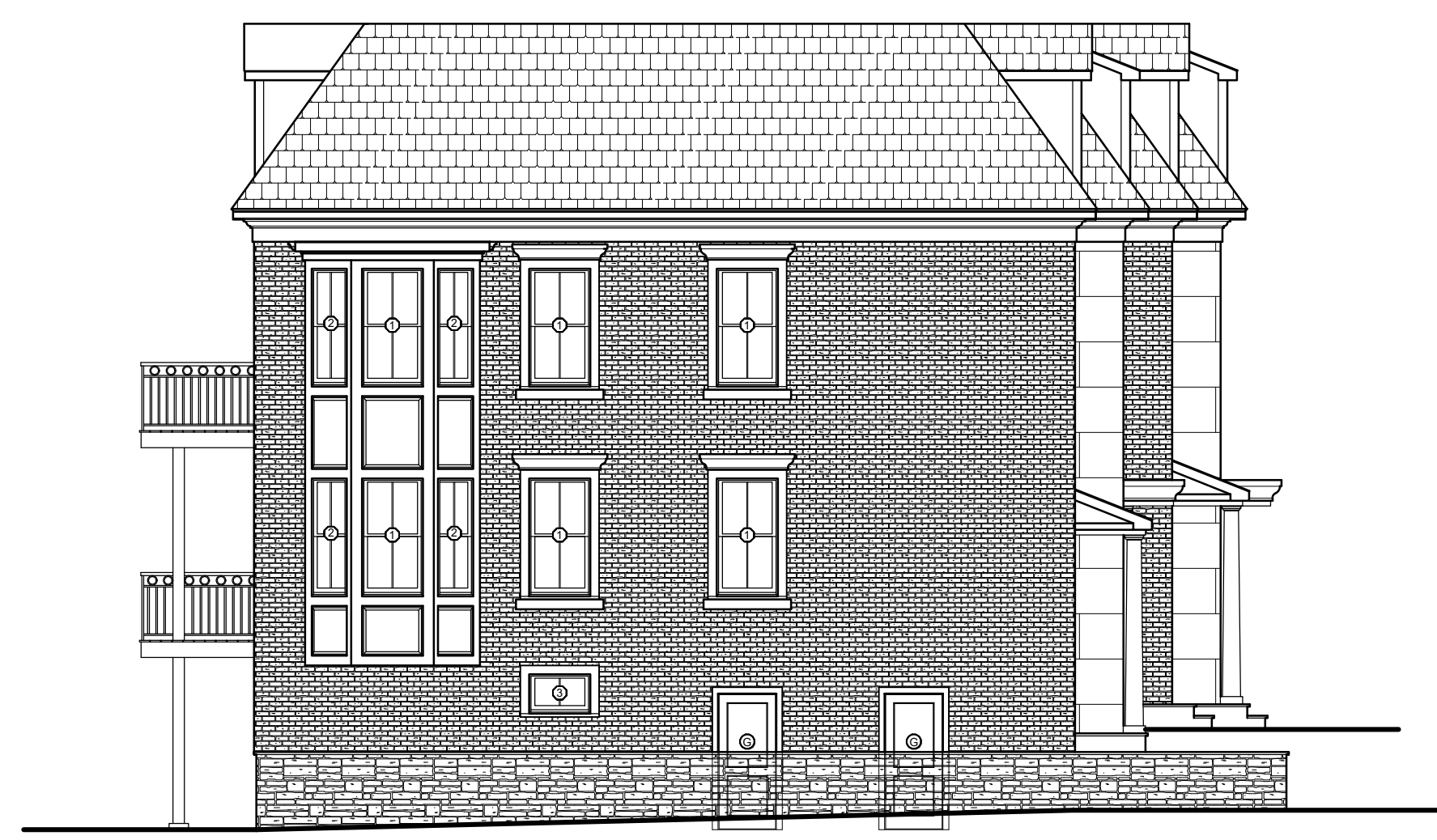
2 SOUTH ELEVATION SCALE: 1/8" = 1'-0"

TOP OF ROOF ELEV. 485 MID POINT OF ROOF ELEV. 456 FIN. THIRD FLOOR ELEV. 402 FIN. SECOND FLOOR ELEV. 364 FIN. FIRST FLOOR ELEV. 360 FIN. ENTRANCE LEVEL ELEV. 363 FIN. GARAGE FLOOR ELEV. 312