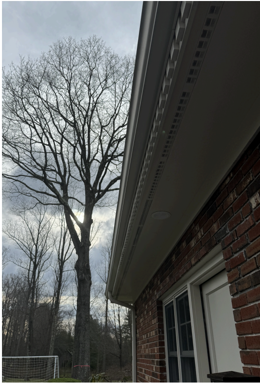
1 Oak to be removed at the rear of the house.