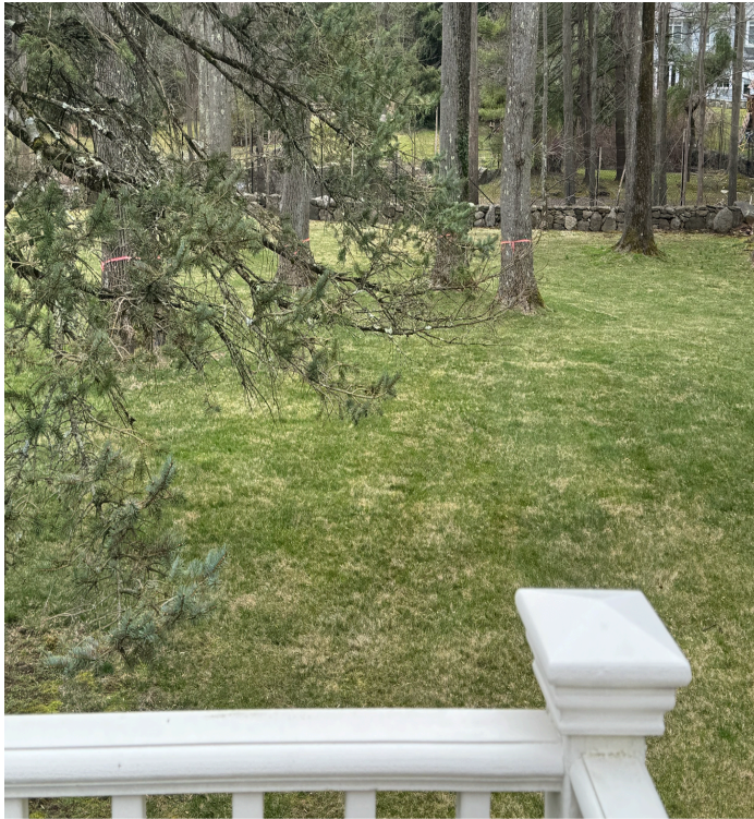
4 Tulips to be removed at the gazebo and deck.